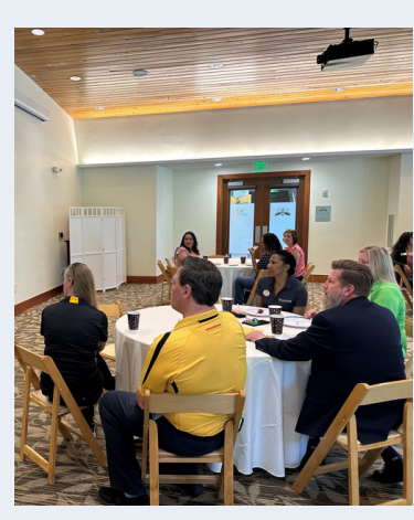
Hall County Mobile Office Hours