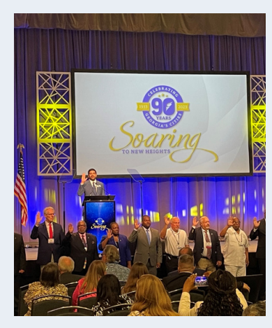
2023 Georgia Municipal Association Officer Swearing in Ceremony