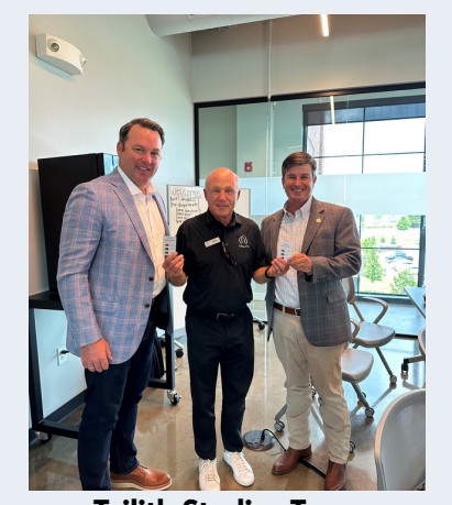
Trilith Studios Tour Senator Brass (R - Newnan) Dan Cathy