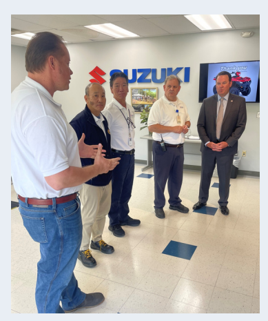
Suzuki Tour in Rome, GA