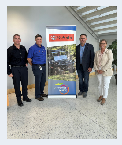
Kubota Tour with Senator Echols (R - Gainesville) in Gainesville, GA