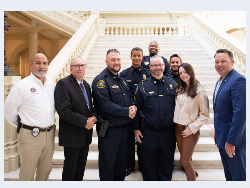
Jefferson Police Department