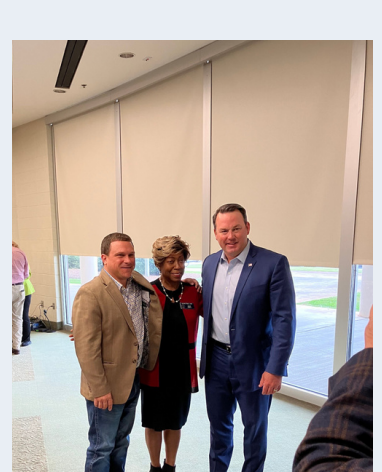
Middle GA Farmers Luncheon GA Agriculture Commissioner Harper Senator Sims (D - Dawson)